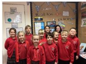
Rights Respecting Team

The Pupil Leadership teams were formed this week. Look out for their news in future editions of the newsletter.